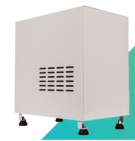
OPTIONAL PROTECTIVE COVER